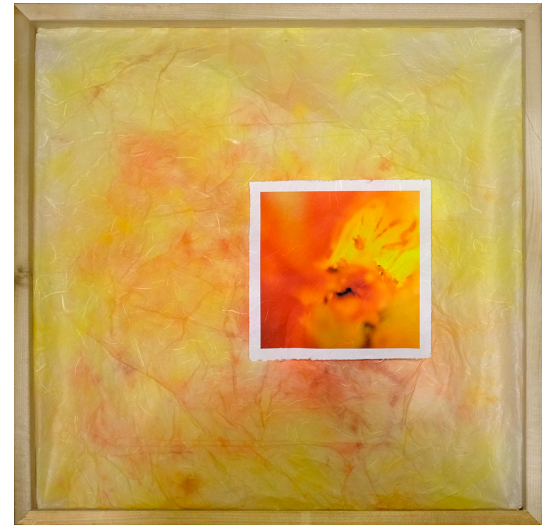
Cindy Shung, Blazing Thunder , 2022 Archival pigment print and watercolor on Mulberry paper, 24 x 24 inches (custom framed)

Contact: 713.524.8253 | gallery@cindylisica.com